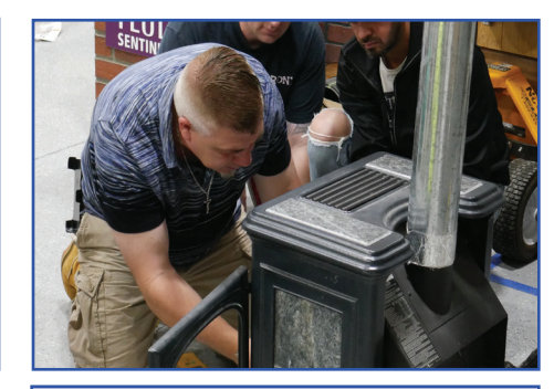
Gas Installation & Troubleshooting $1,500 (June)