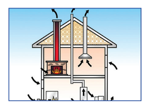
Chimney Physics $1,500 (March & August)

5 Available: Feb 25-Mar 2; May 6-11; Jul 22-27; Aug 19-24; and Sep 16-21